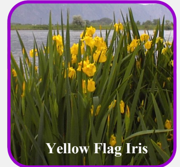
Yellow Flag Iris

Before you know it, the Spring planting season will be here and many of us are already receiving seed catalogs in the mail. But, before you start placing your seed orders for this year's flower garden, you need to be aware that seed packets can be, and often are, a source for invasive and noxious weeds to get started growing on your property.