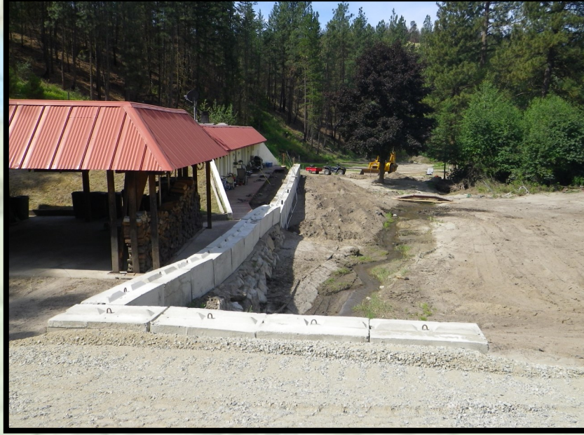
Emergency Watershed Protection 13 structures installed to protect homes at high risk of flooding and debris flows. Partners: WA Conservation Commission, Natural Resources Conservation Service (NRCS)