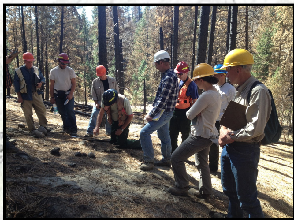
Burned Area Emergency Response Team for Private and State Lands. Okanogan CD coordinated this first-ever burned area evaluation team for non-federal lands. 16 different agencies participated. Key partners: US Forest Service, FEMA, US Army Corps of Engineers, and Washington State.