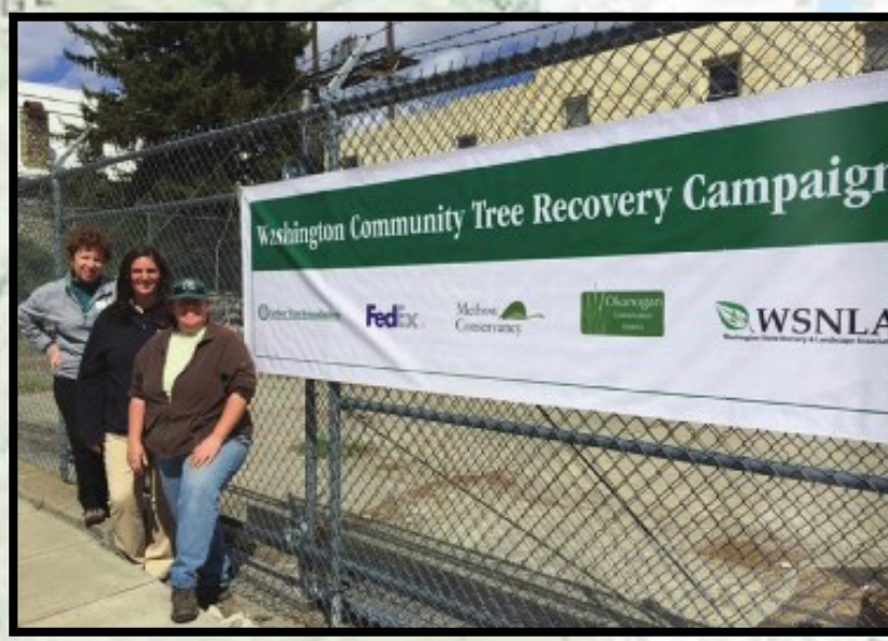
6,000+ Plants Distributed Partners: Methow Conservancy, Washington State Nursery and Landscape Association, and the Arbor Day Foundation