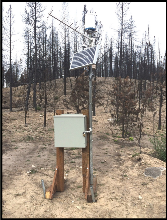
14 Rapid-reporting Rain Gages Installed to improve flash flood warning system. Partners: National Weather Service, Washington Department of Ecology.