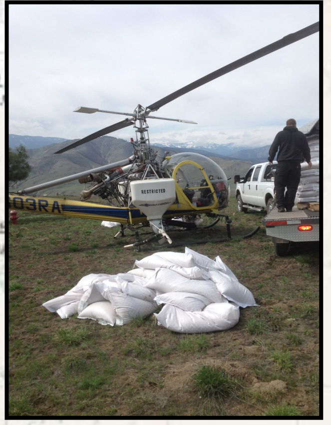
Erosion Control Re-seeding 35 landowners, 1,945 acres. Applied by helicopter, the seed mix combined a quick-germinating, short-lived, sterile wheat hybrid along with native grass species.