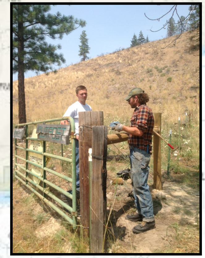
Critical Area Fencing 9 fence projects to protect to protect surface water quality from uncontrolled livestock access. Partner: Washington Conservation Corps