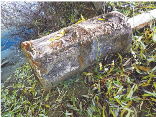
From this (non-compliant screen that doesn't protect threatened fish species)...