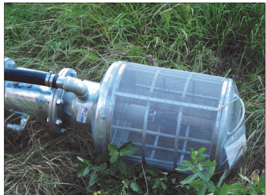
...to this (brand new, fish-friendly, self-cleaning, and 100% grant funded)!