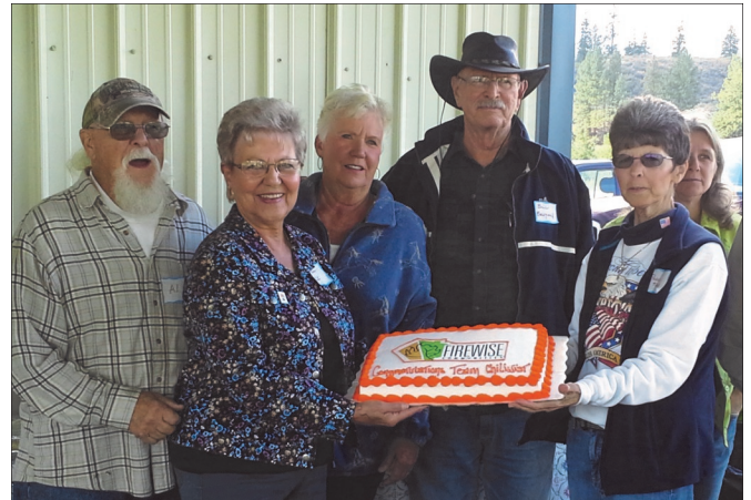
The Chiliwist community celebrated their Firewise Communities USA recognition in September 2013.